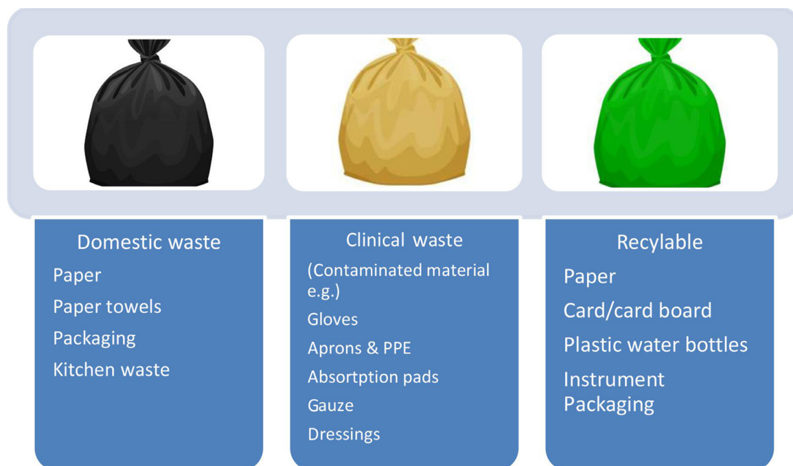
Figure 1 Examples of sorting waste streams (depending on local policy). PPE, personal protective equipment.

legislation involving recycling of contaminated medical waste. 12